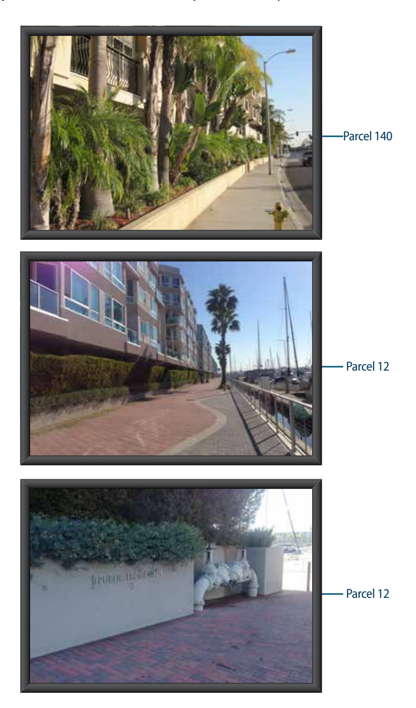
Figure 2 Examples of Project Credits Claimed in Marina del Rey That Are Clearly Accessible to the Public

roadway access to the parking spaces. These credits appear to be allowable improvements according to the county code; however, as the photographs in Figure 3 on the following page demonstrate, it is unclear whether the general public is aware of, benefits from, or even uses these open spaces. For example, we think it unlikely that the general public will benefit from the gravel courtyard in front of the residential building. Furthermore, we noted that the parking spaces at this property were marked "guest parking" or were not marked at all, and this situation may cause some members of the public to assume that the parking spaces are for residents only.