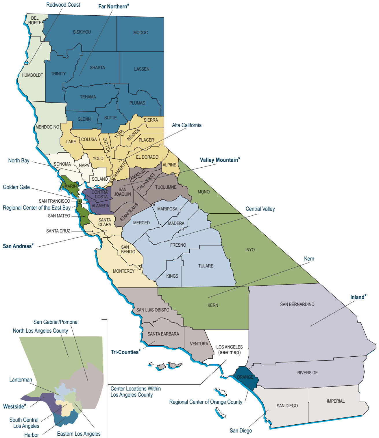
Figure A Map of Regional Center Service Areas